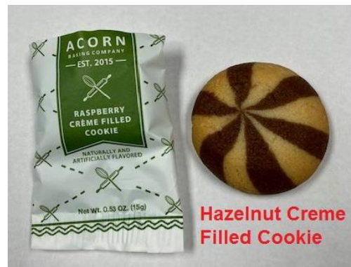
Image of the mispacked Hazelnut Crème Filled cookie

If you have any questions concerning this recall, please contact Houdini Customer Care Monday – Friday from 8:00 AM – 5:00 PM at 866-712-5910. For further information, you can check our website at www.houdiniinc.com/recall/raspberrycookie