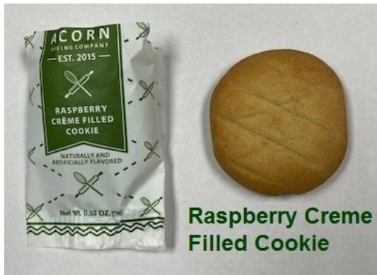
Image of the correct Raspberry Crème Filled cookie