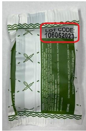
Lot code on back of packaging